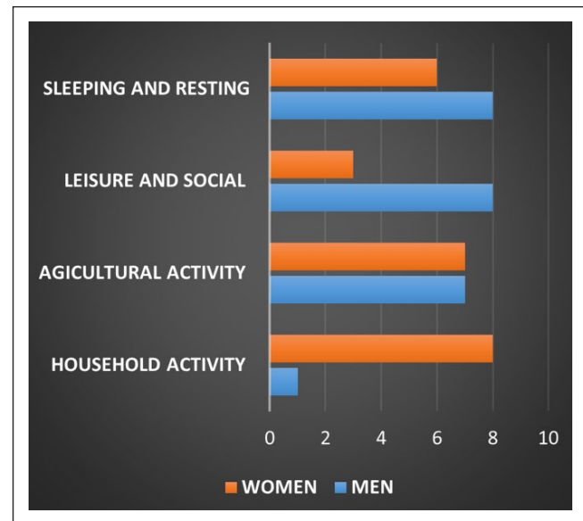
Figure 1. Time poverty in the three research sites.

In fact, as a result of being subject to exploitative cultural relations, the majorities of the women participants of the research not only suffer from extreme resource poverty and deprivation but also are victims of time poverty. In the three research sites, women spend more than 15 hr per day on agricultural and domestic work, whereas men spend only about 8 hr on agricultural and domestic work (illustrated in