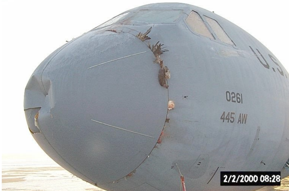
Figure 2. Canada Goose strike on radome of US Air Force C-141.