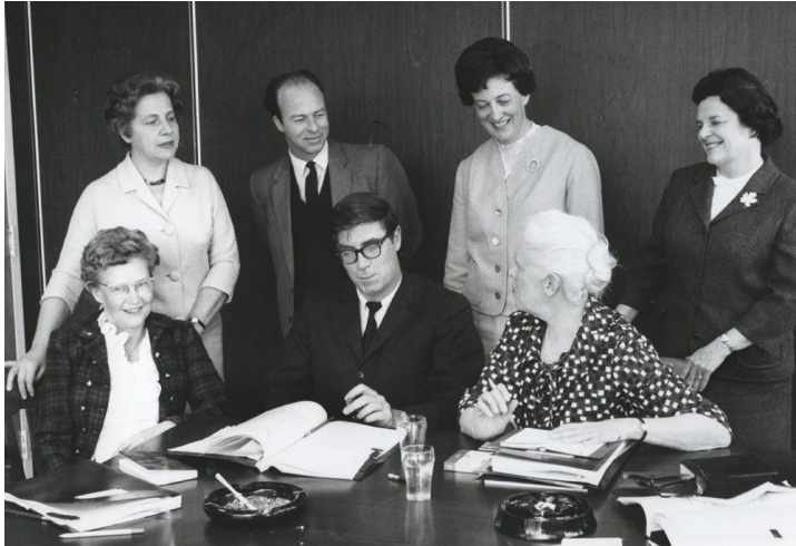
Commissioners of the Royal Commission on the Status of Women in Canada .

Royal Commissions are formal public inquiries into defined issues of public concern. Commissioners are appointed by the Governor-in-Council and have the power to conduct investigations by subpoenaing witnesses, take evidence under oath, requisition documents, and hire expert staff. ( Royal Commissions )