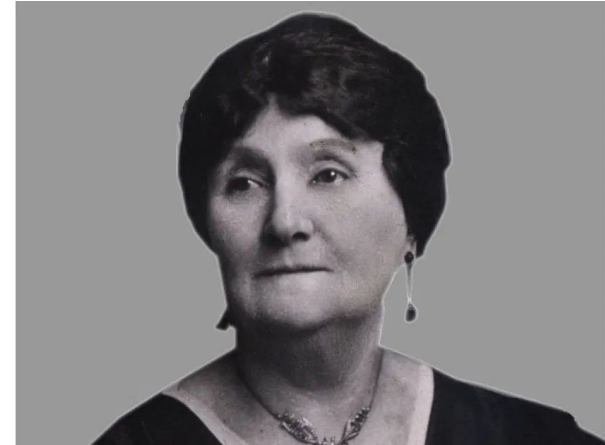
Canada 150: Mary Ellen Smith