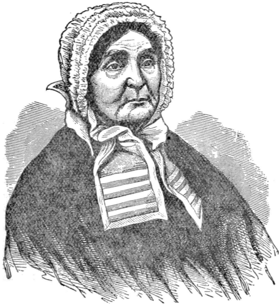
Secord, Laura Ingersoll National Historic Person