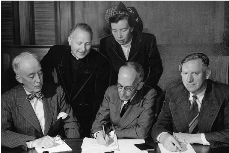
Members of the Massey Commission in 1951.