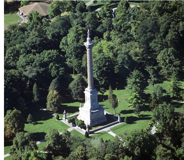
Queenston Heights Parks Canada - Queenston Heights National Historic Site of Canada