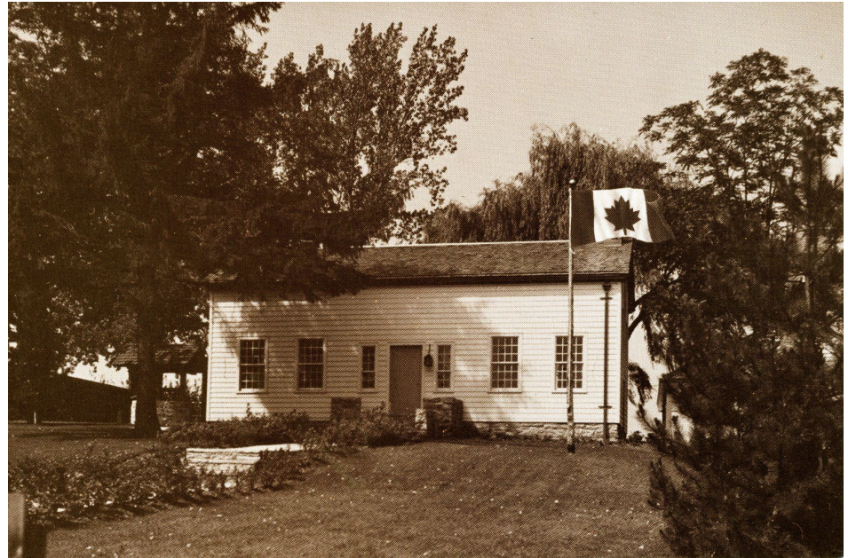
Full Image View: Laura Secord Homestead, Queenston, Ontario.