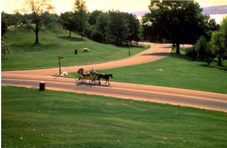
Plains of Abraham, Quebec City Battle of the Plains of Abraham