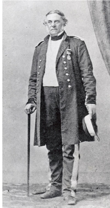
Sir James Douglas