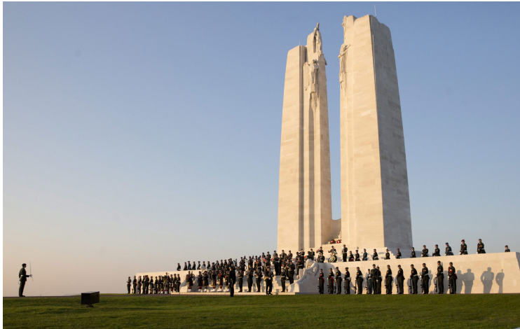
Trudeau pays homage to fallen Canadian soldiers at Vimy Ridge